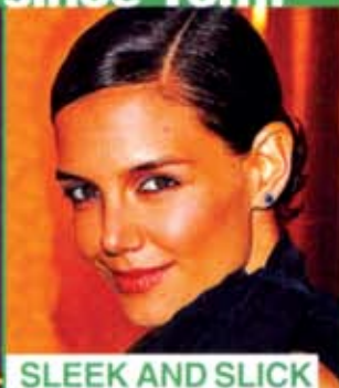
SLEEK AND SLICK